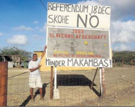
The campaign for Bonaire's December 18 constitutional referendum has started. The only question will be whether residents qualified to vote agree with the current content given to the earlier choice for direct ties with the Netherlands. Those supporting the "No" option are most visible for now

"This training course will not only harmonise the skills of our security officers with those of the security agencies of government, but also provide additional confidence that safety and security remain the most important task of the airport.'